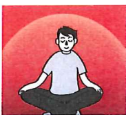
Stop, Breathe & Think

Mini 10 minute meditations. Once you've completed the initial free course you can pay to access more meditations