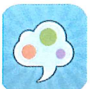
SAM (Self-help for Anxiety Management)

Specifically for young people to help manage anxiety. Lots of tools, techniques and advice