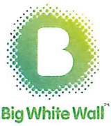
Big White Wall

Uses the phone's accelerometer to wake you up within a half hour window when you are at the lightest level of sleep- waking up from lighter sleep should help you feel more refreshed and feel better more generally