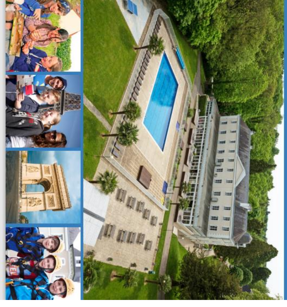
A community of transformation founded on love, hope & trust

For more details please visit our website www.pgl.co.uk/cgr Information about your child's PGL trip to France